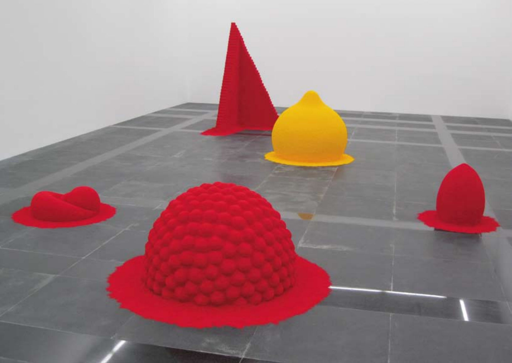
Anish Kapoor, To Reflect an Intimate Part of the Red , Mixed Media, Pigment, 1981.