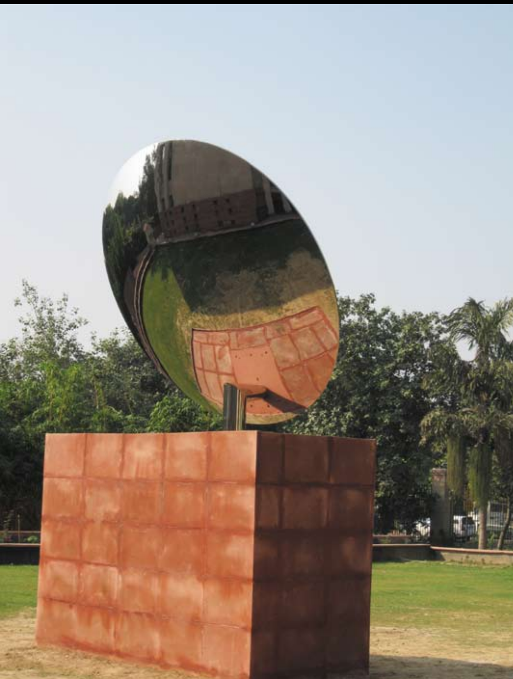
Anish Kapoor, Sky Mirror , Stainless Steel.

absolute objects is taken to a different level with this one. Mirrored objects that have been made right since the Egyptians have always been convex objects meaning positive forms. Now what happens with positive form is that they camouflage themselves in the space. The concave objects don't do anything about the camouflage, they actually hold the space. And the reason