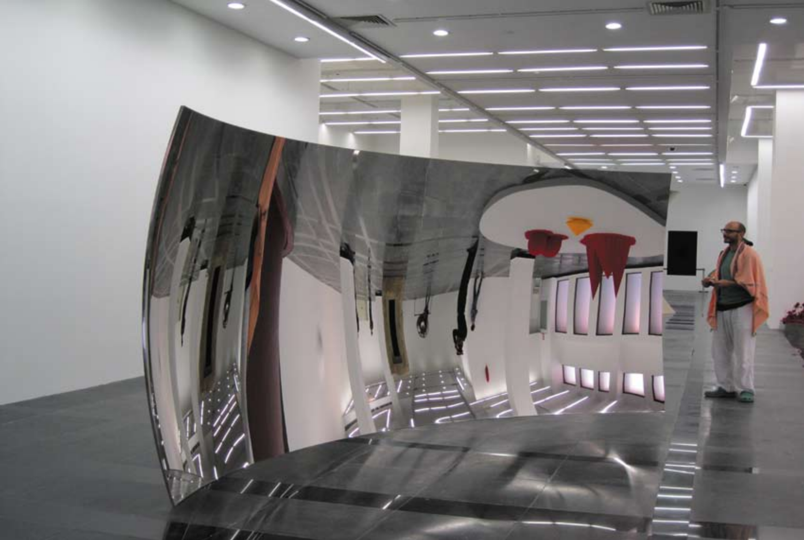
Anish Kapoor, Vertigo , Stainless Steel, 1981.

has to do with power. In a way, art also plays in that game. Why not?