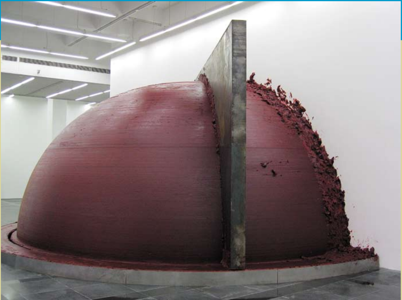
Anish Kapoor, Past, Present, Future , wax, oil based paint, 2006.

The darling of the international art world, someone whose stature increases with each successive show, Anish Kapoor, has finally managed to get his works